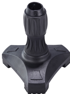
HurryFlex Cane Tip