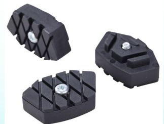
HurryCane Feet Replacement Feet