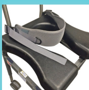
Rapid Dry Positioning Belt