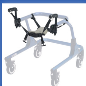
Hip Positioner & Pad

The Moxie™ GT offers a tremendous amount of versatility to meet the needs of most users. Height-adjustable and available in three sizes, the Moxie GT can be used in either a posterior or anterior position.