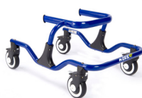
Warrior Blue (Small & Medium Only)