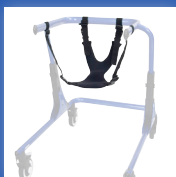
Soft Seat Harness