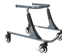
Sword Gray (Large Only)