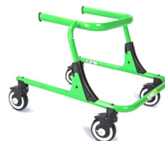
Magic Green (Small & Medium Only)