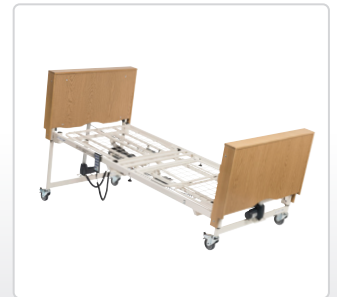
Can be used in the low and reverse trendelenburg positions