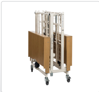
Built in transport stand for storage and transport

The Solite Pro includes an electric backrest, knee break function, and improved actuators in the variable height mechanism that add to the strength of the bed, all while retaining an attractive, domestic look and feel.