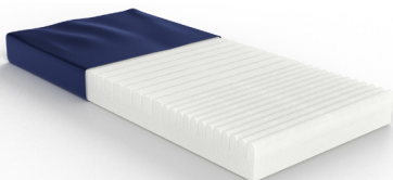
Therapeutic 5 Zone Mattress Replacement Item # 15019