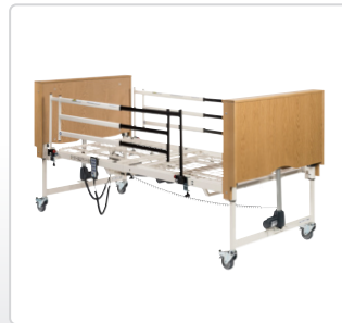
Available with 3 rail options - full, standard and low