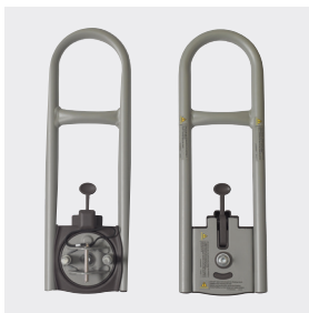
Model #PLTCAB Model #PLTCABL, left Model #PLTCABR, right

Compatible with the P503, P703 and P903 Bed