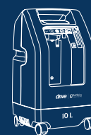
10 Liter Concentrator